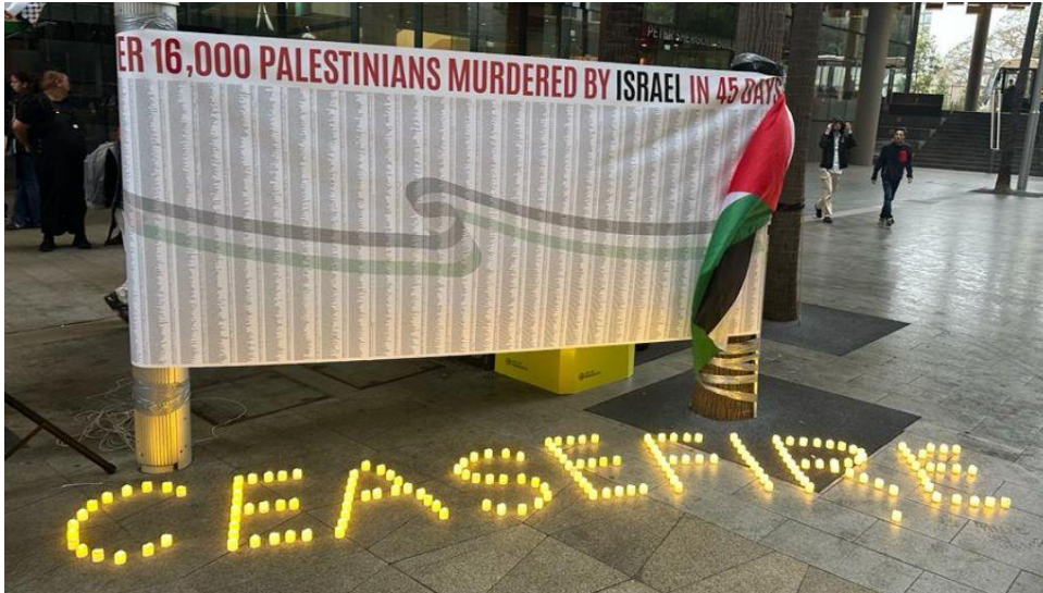
Palestinian Solidarity Protest at the Aboriginal Tent Embassy on 8 December, calling for permanent ceasefire, end to