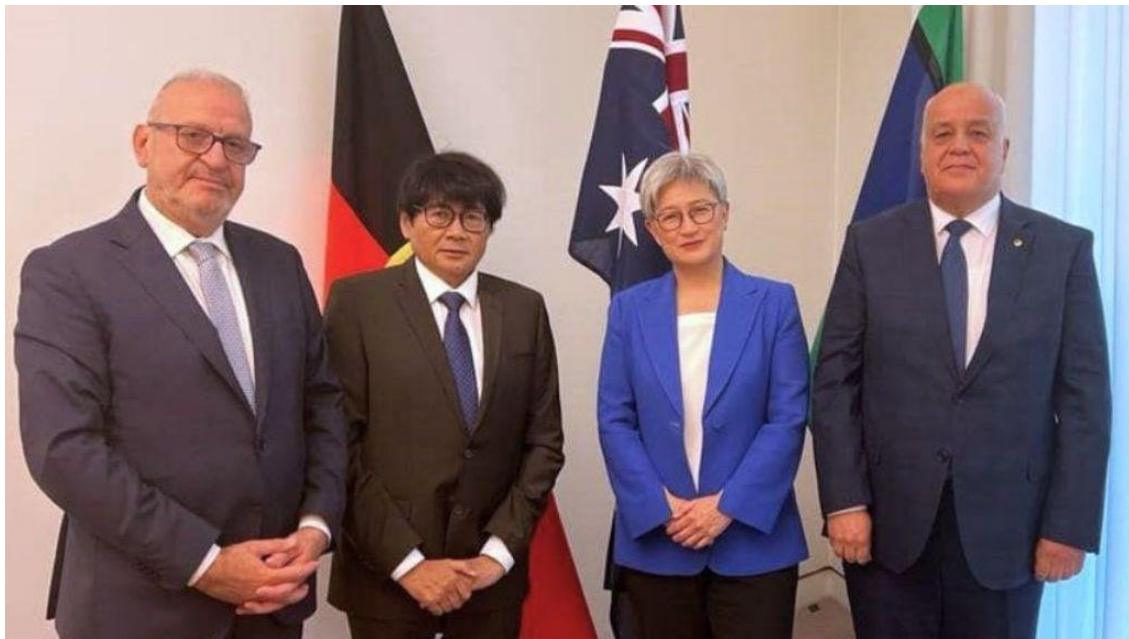
On 6 December, a delegation representing the Organisation of Islamic Cooperation (OIC) Heads of Mission Group met with Foreign Minister Penny Wong at Federal Parliament House for a discussion of the humanitarian catastrophe in Gaza and calling for a complete and permanent ceasefire. [read more]