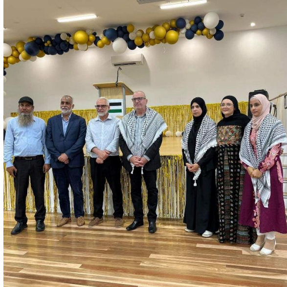
On 10 December, the General Delegation of Palestine observed International Day of Solidarity with the Palestinian People for a second time in Canberra. [Read More]