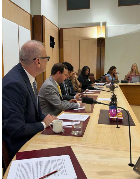
On 6 December, Ambassador Abdulhadi participated in a Roundtable Discussion on the United Nations Declaration on the Rights of Indigenous Peoples (UNDRIP) hosted by Senator Lidia Thorpe.