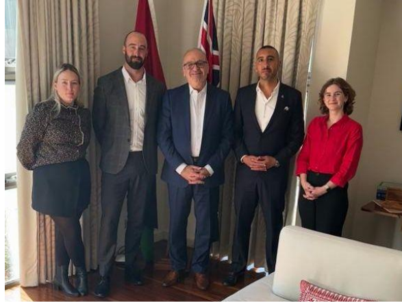
On 27 November, the General Delegation of Palestine met with a delegation from Amnesty International, Australia.