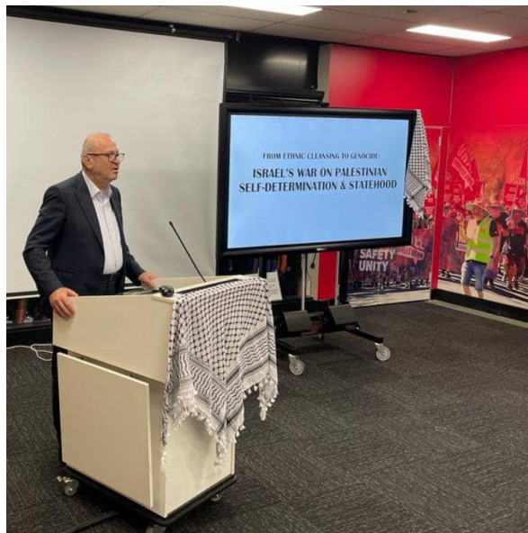
Observing International Day of Solidarity with the Palestinian People on 16 December, in cooperation with Falesteen Inc. at the United Workers Union in Brisbane. [Read More]