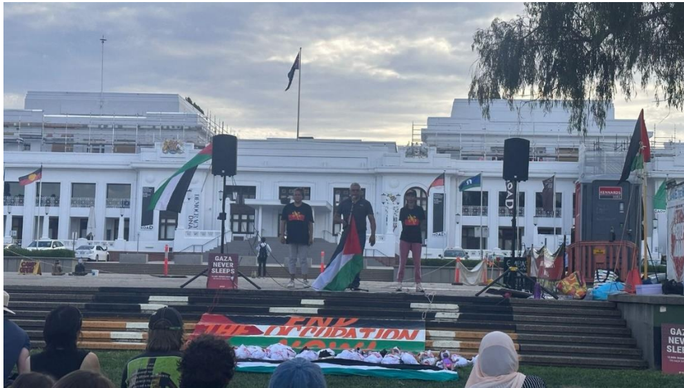
Israeli apartheid, and indigenous land rights in both Palestine and Australia.