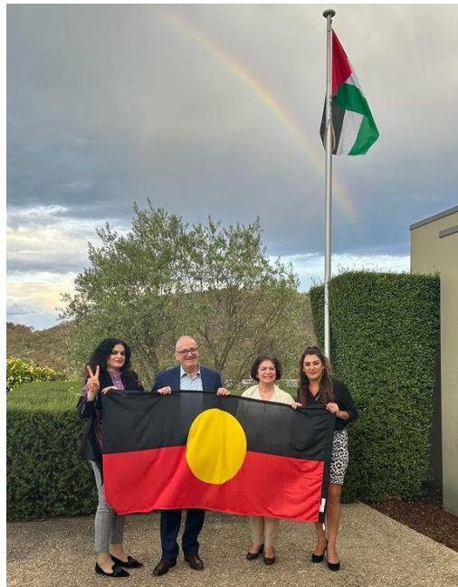
On 7 December, the Ambassador and Embassy Staff met with Senator Lidia Thorpe at the Palestinian Embassy in Canberra.